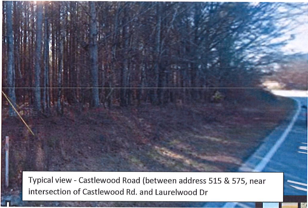
Typical view - Castlewood Road (between address 515 & 575, near intersection of Castlewood Rd. and Laurelwood Dr