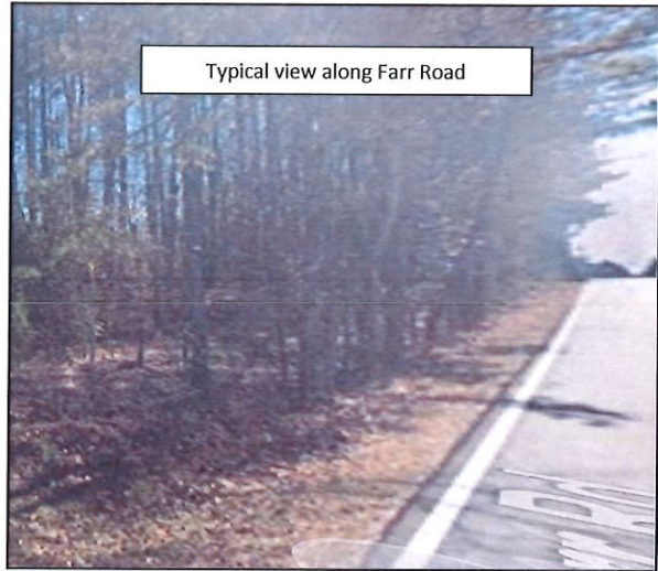
Location: Site 2 – Farr Road and Donegal