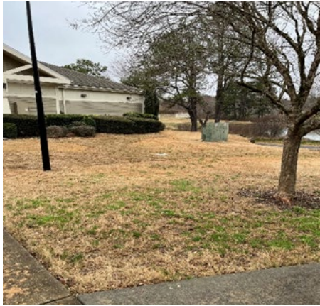
Area Between Library & Rec