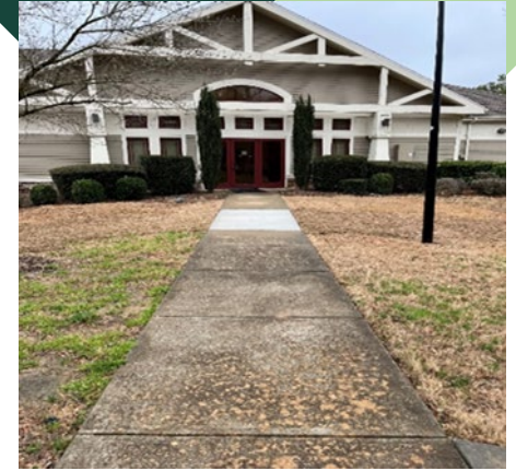
Rearview of Library