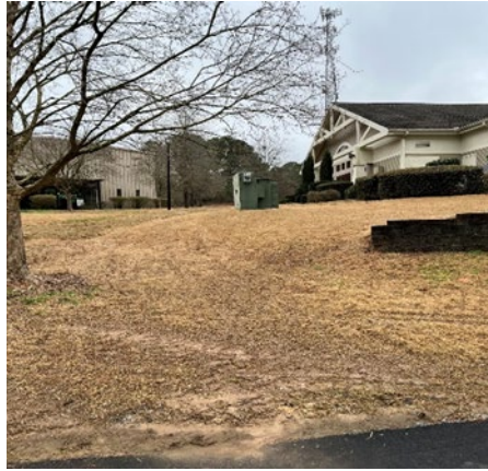
View from Walking Trail