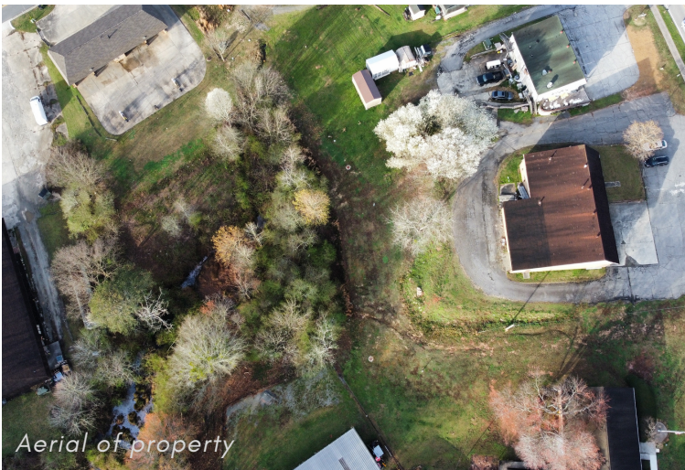
Aerial of property