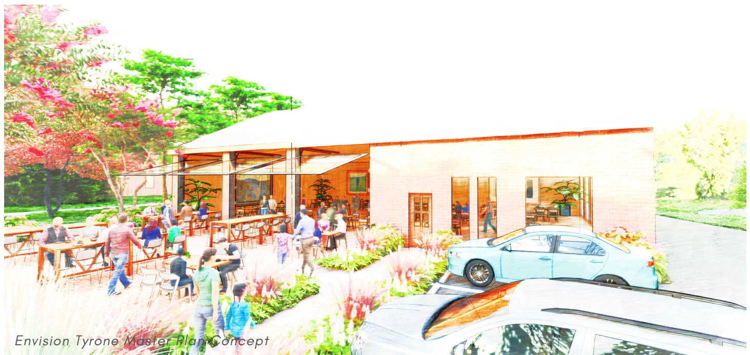
Envision Tyrone Master Plan Concept