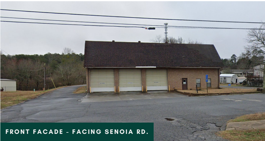
FRONT FACADE - FACING SENOIA RD.