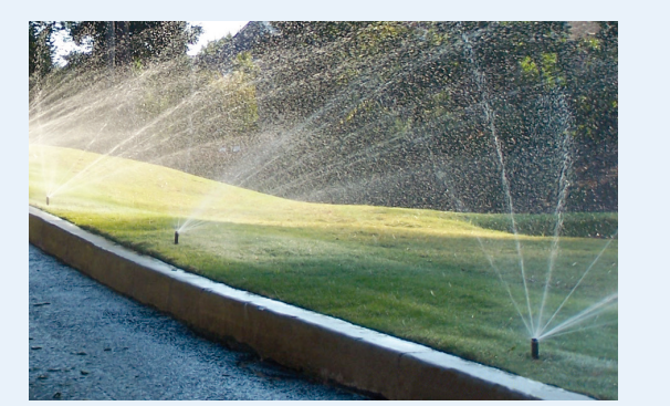
Sprinkler heads are only directed towards grass so that the pavement is not being watered.

2. Make sure your sprinkler heads, when extended, rise above the height of the grass for uniform coverage. Use taller heads in flower and shrub beds.