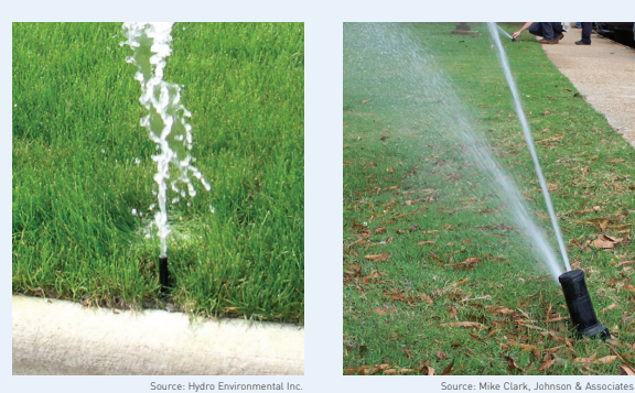
Improperly functioning rotor sprinkler head