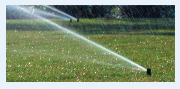
Properly functioning rotor sprinkler head